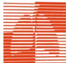
Croatian Respiratory Society