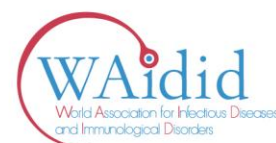
World Association for infectious Diseases and Immunological Disorders