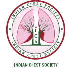
Indian Chest Society