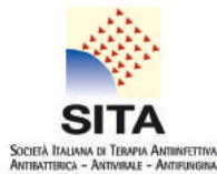
Società Italiana di Terapia Antinfettiva Antibatterica - Antivirale - Antifungina