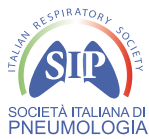
Società Italiana di Pneumologia